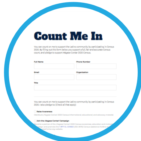
Campaign Commitment Form