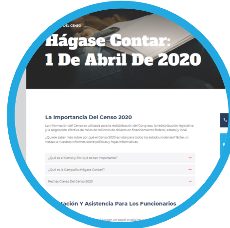
Downloadable Partner Resources