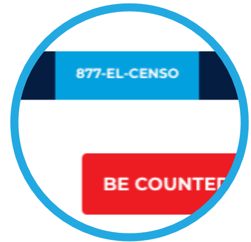
Direct Cell Connection to National Bilingual Hotline